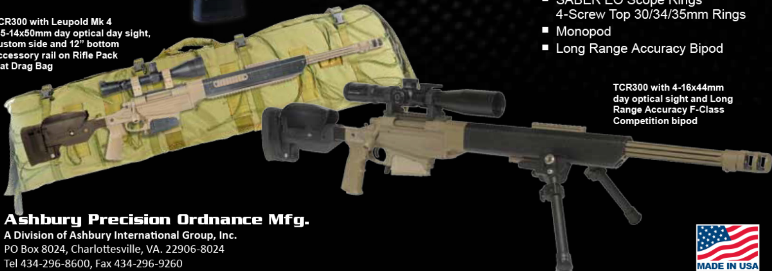
TCR300 with 4-16x44mm day optical sight and Long Range Accuracy F-Class Competition bipod