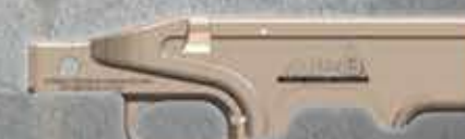
A3 5/10rd Magazine