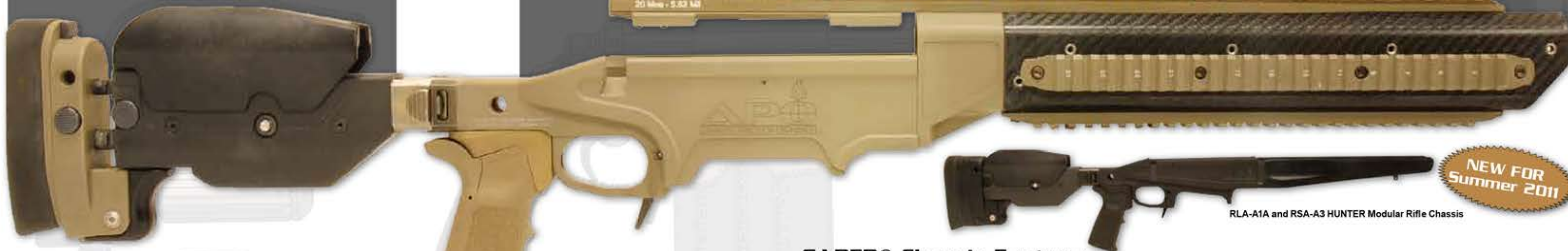
20 Moa - 5.82 MOA