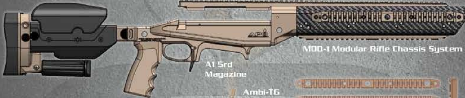
MOD-1 Modular Rifle Chassis System