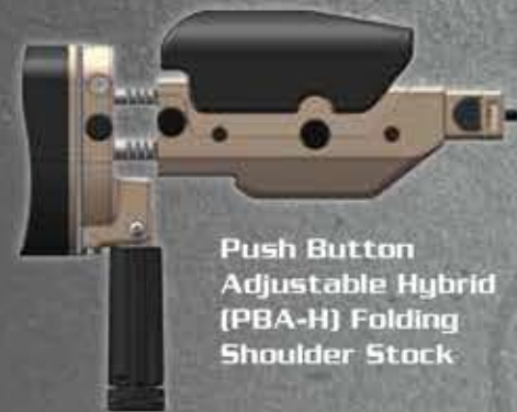
Push Button Adjustable Hybrid (PBA-H) Folding Shoulder Stock