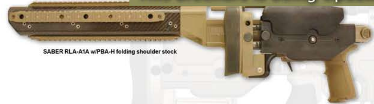
SABER RLA-A1A w/PBA-H folding shoulder stock