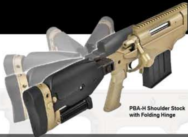
PBA-H Shoulder Stock with Folding Hinge