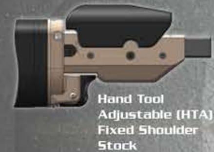
Hand Tool Adjustable (HTA) Fixed Shoulder Stock