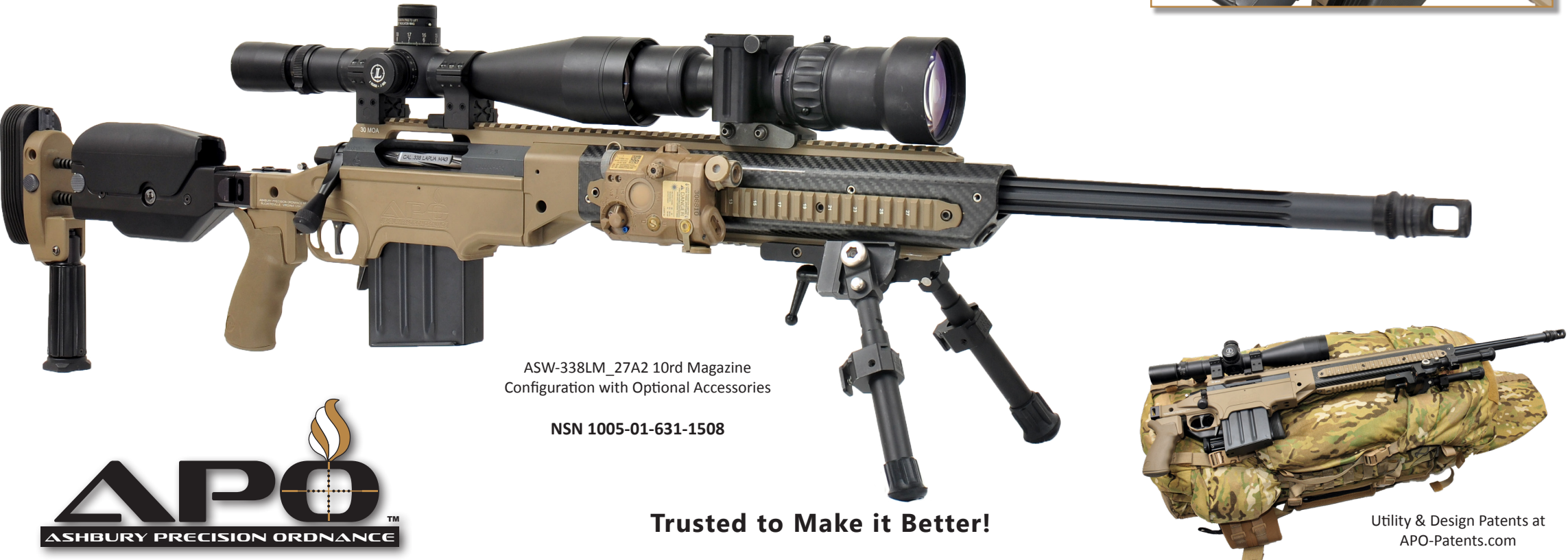
ASW-338LM_27A2 10rd Magazine Configuration with Optional Accessories